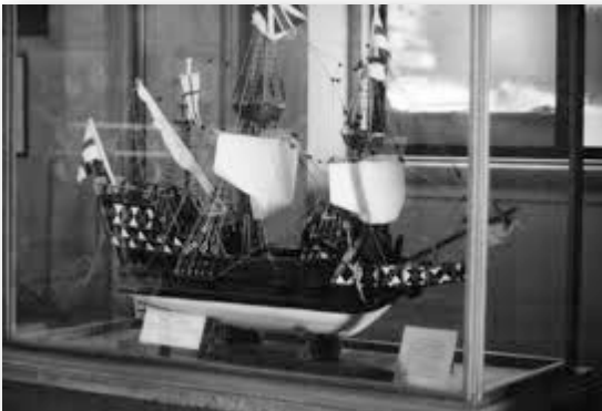
Model of the Sailing Ship Lyon

Packrat Publishing has listed over 7100 families who immigrated to America between 1602 and 1638 on 250 ship voyages during the period of "The Great Migration." The database is available on-line for personal use and downloading for non-commercial use with permission. The database can be located at http://www.packrat-pro.com/ships/shiplist.htm